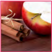
Apple & Cinnamon* Fragrance Oil TBD