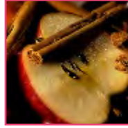
Crafters Choice™ Apple N' Spice Fragrance Oil 115