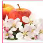
Crafters Choice™ Apple Blossom Soy Candle Fragrance Oil 531