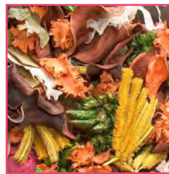
Crafters Choice™ Spiced Potpourri Fragrance Oil (393)