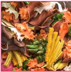
Crafters Choice™ Spiced Potpourri Fragrance Oil (393)