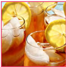
Crafters Choice™ Iced Tea Twist* Fragrance Oil 688