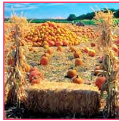
Crafters Choice™ Harvest Type Fragrance Oil 370