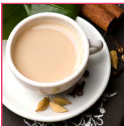
Crafters Choice™ Sweet Vanilla Chai Fragrance Oil