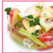
Apple Pecan Sage Fragrance Oil TBD