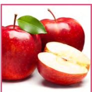
Crafters Choice™ Gingham Apple* Fragrance Oil TBD