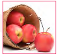
Crafters Choice™ Fresh Picked Apple* Fragrance Oil 165