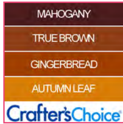
Crafters Choice™ Candle Color Dye Blocks - Mahogany