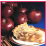
Crafters Choice™ Hot Apple Pie Fragrance Oil 333