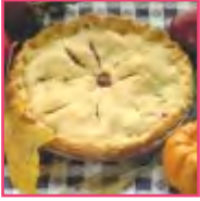
Crafters Choice™ Apple Pie Fragrance Oil 104