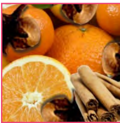
Crafters Choice™ Orange Clove Fragrance Oil 690