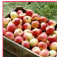
Crafters Choice™ Country Apple* Fragrance Oil 476