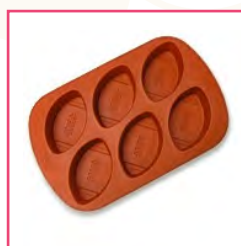
Football Silicone Mold