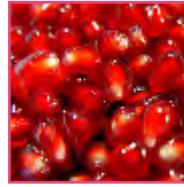
Crafters Choice™ Pomegranate Apple Fragrance Oil 635