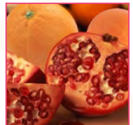
Crafters Choice™ Pomegranate & Sweet Orange* Fragrance Oil 500