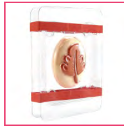
Sheridan Leaf 3D Plastic Soap Mold