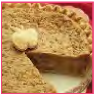
Crafters Choice™ Apple Caramel Crunch Fragrance Oil 558