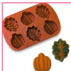
Leaf & Pumpkin Combo Silicone Mold