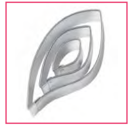
Leaf Shaped Cutters - Set of 3