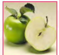
Crafters Choice™ Green Apple Fragrance Oil 266