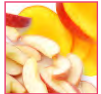
Apple Mango Tango* Fragrance Oil TBD