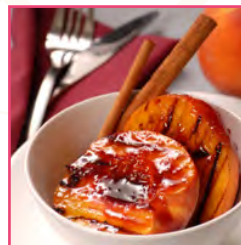
Spiced Peaches Soy Candle Fragrance Oil