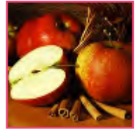
Crafters Choice™ Apple Jack N' Peel Type Fragrance Oil 148