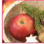
Crafters Choice™ Apple Balsam Pine Fragrance Oil (152)