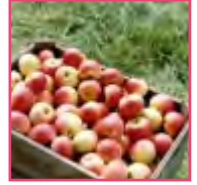
Crafters Choice™ Apple Orchard Fragrance Oil 273