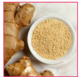
Crafters Choice™ Ginger Spice Fragrance Oil 161