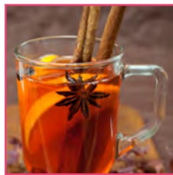
Crafters Choice™ Cinnaberry Cider Soy Candle Fragrance Oil TBD