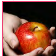
Crafters Choice™ Enchanted Apple* Fragrance Oil 373