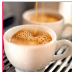
Coffee Bar Fragrance Oil