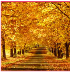
Crafters Choice™ Autumn Breeze Fragrance Oil 535