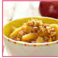
Crafters Choice™ Reed Stick Scented Base - Apple Crisp 261