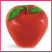
Crafters Choice™ Apple with Leaf Soap Mold (CC 178)