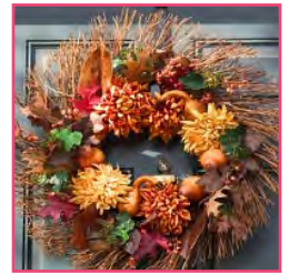
Crafters Choice™ Autumn Wreath* Fragrance Oil 545