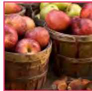
Crafters Choice™ Apples & Acorns Fragrance Oil 534