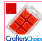
Neon Soap Bars