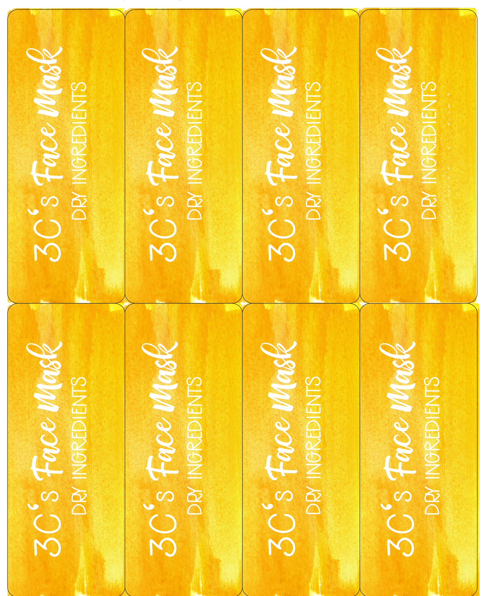
Label Design Courtesy of Wholesale Supplies Plus - Label Size - L1